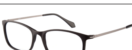
C20 52-18 BLACK MATTE/GUN