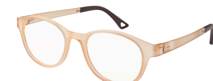
C15 49-19 NEW BRN BLUSH