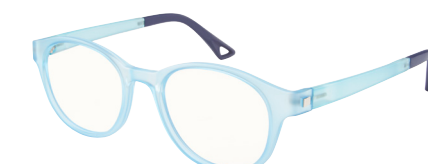
C16 49-19 NEW BLUE BLUSH