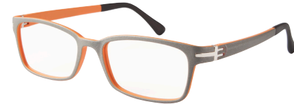
C8 51-18 GREY/PUMPKIN