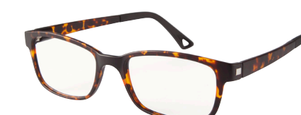
C10 50-18 NEW TORT