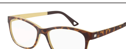
C1 53-18 TORTOISE/YELLOW