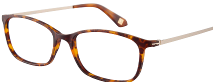
C10 52-18 NEW TORT/GLD