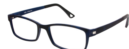
C6 52-18 BLACK/BLUETORT