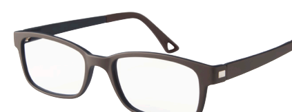
C5 50-18 BROWN/BLUE