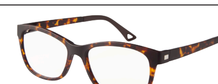
C10 53-18 TORTOISE