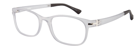
C14 50-18 GRAY BLUSH