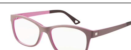
C4 53-18 BROWN/PINK