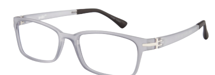
C14 51-18 GRAY BLUSH