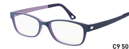
C9 50-18 BLUE/PURPLE