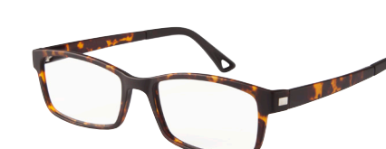
C10 52-18 NEW TORT