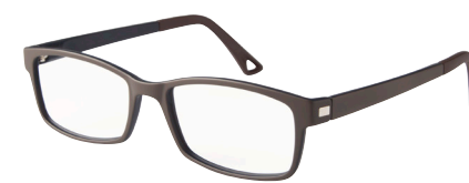
C5 52-18 BROWN/BLUE