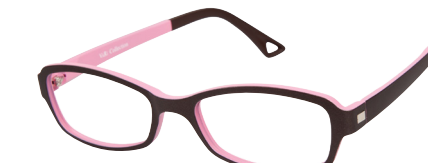
C4 48-18 BROWN/PINK