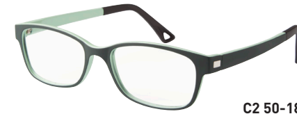
C2 50-18 BLUE/GREEN