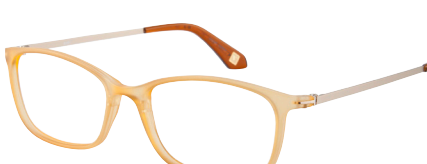
C18 52-18 NEWBLUSHGOLD/GLD