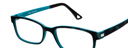
C7 50-18 BLUETORT/BLUE