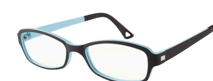
C3 48-18 BLACK/BLUE