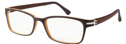
C11 51-18 BROWN/WOOD