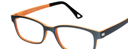
C8 50-18 GREY/PUMPKIN