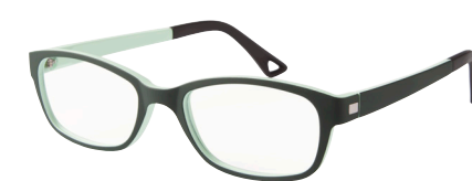
C2 48-18 BLUE/GREEN