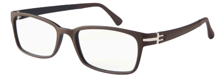
C5 51-18 BROWN/BLUE