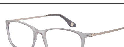
C19 52-18 STEELGRYBLUSH/GUN