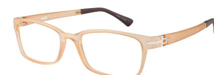
C15 51-18 BROWN BLUSH