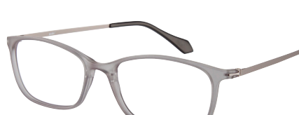
C19 52-18 STEELGRYBLUSH/GRY