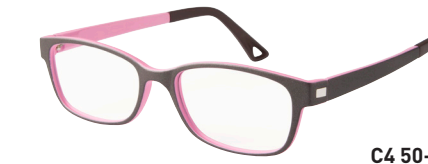
C4 50-18 BROWN/PINK