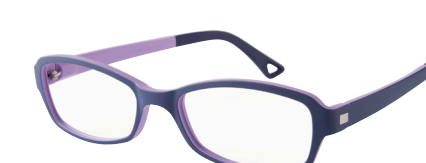
C9 48-18 BLUE/PURPLE