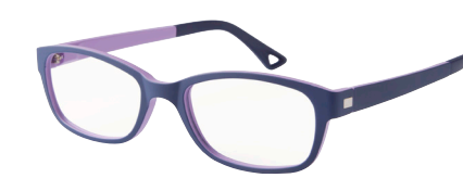
C9 48-18 BLUE/PURPLE