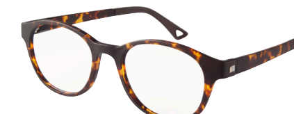
C10 49-19 NEW TORT