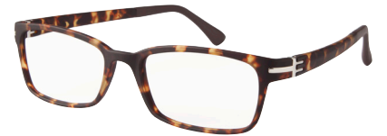
C10 51-18 NEW TORT