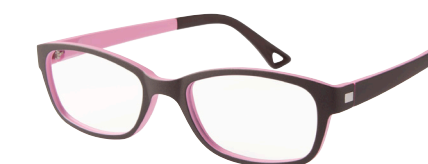
C4 48-18 BROWN/PINK