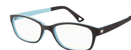
C3 48-18 BLACK/BLUE