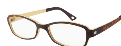
C1 48-18 TORT/YELLOW