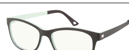
C2 53-18 BLUE/GREEN