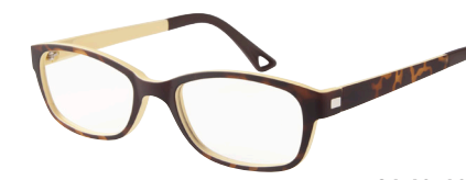
C1 48-18 TORT/YELLOW