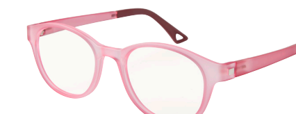
C17 49-19 NEW RED BLUSH