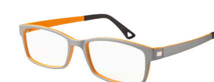
C8 52-18 GREY/PUMPKIN