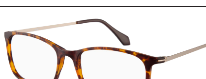
C10 52-18 NEW TORT/GLD