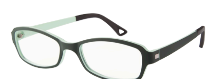
C2 48-18 BLUE/GREEN