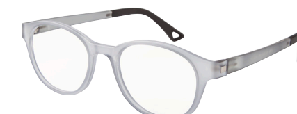
C14 49-19 NEW GRY BLUSH