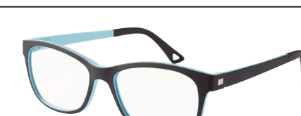
C3 53-18 BLACK/BLUE