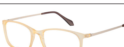
C18 52-18 NEWBLUSHGOLD/GLD