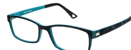
C7 52-18 BLUETORT/BLUE