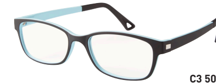
C3 50-18 BLACK/BLUE