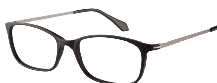
C20 52-18 BLACK MATTE/GUN